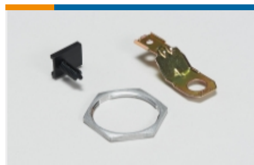
Other Automotive Connector Accessories(5)