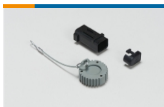
Automotive Connector Caps &amp; Covers (6)